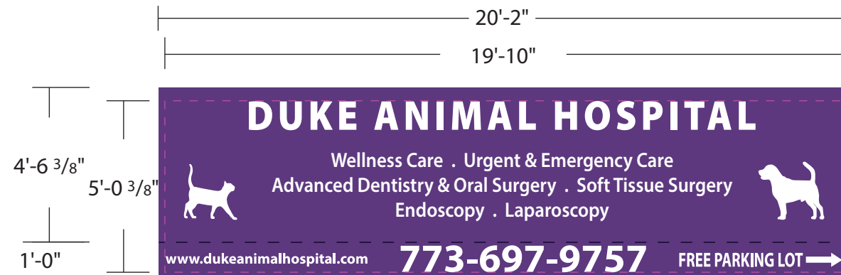
Center Face View