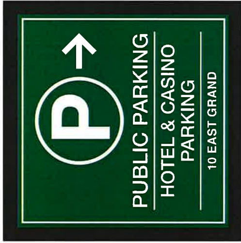
SIDE 1 - (1)