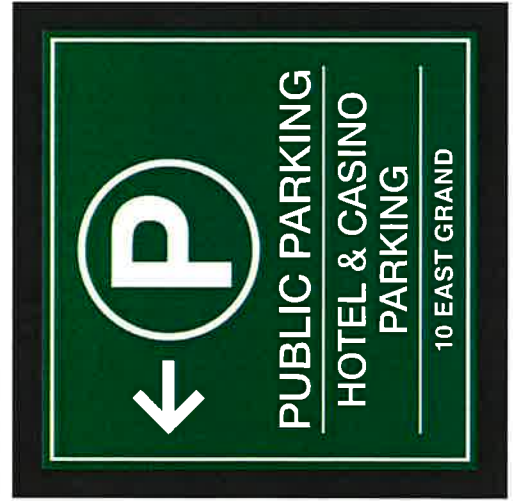
SIDE 2 - (1)