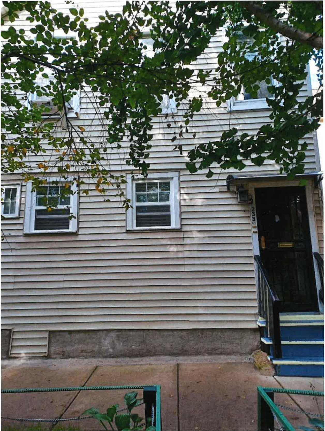
FRONT VIEW OF EXISTING 2-FLAT