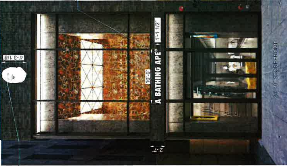
S/F ILLUMINATED FACE-LIT LOGO SIGN