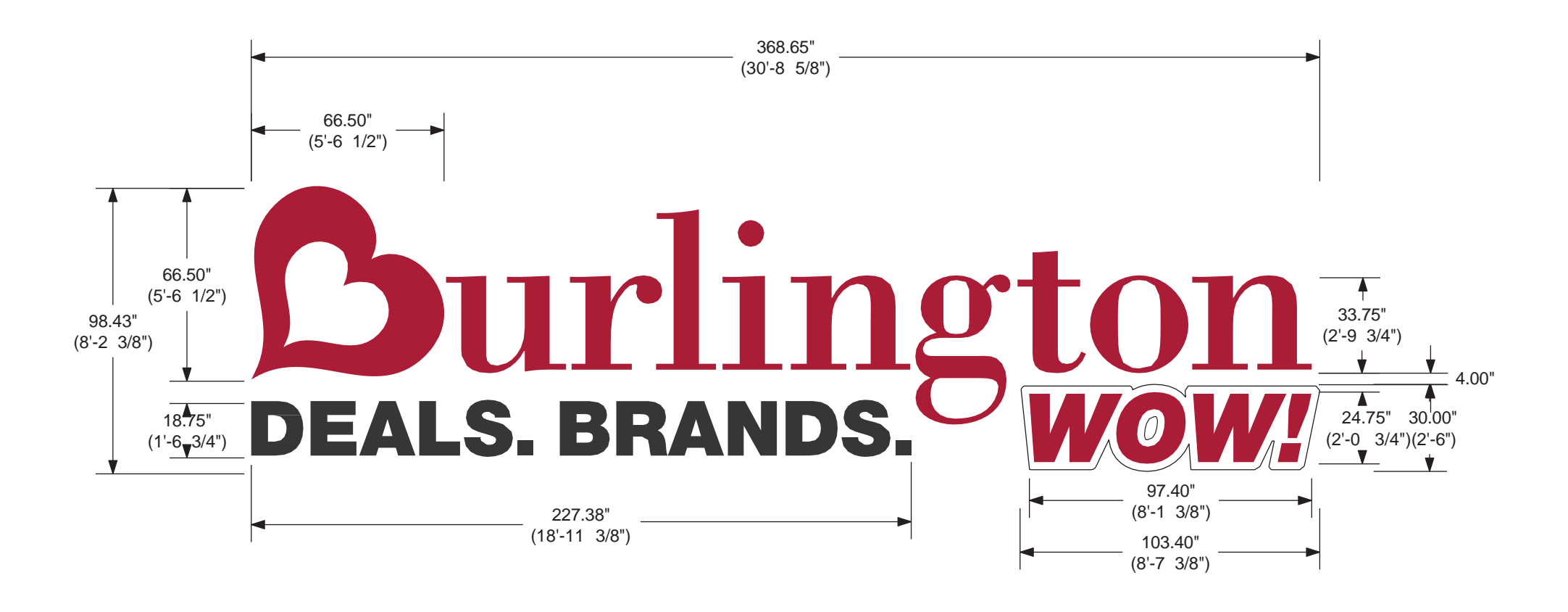
RENDER IS AN ESTIMATION ROVED BY BURLINGTON PRIOR TO INSTALLATION.