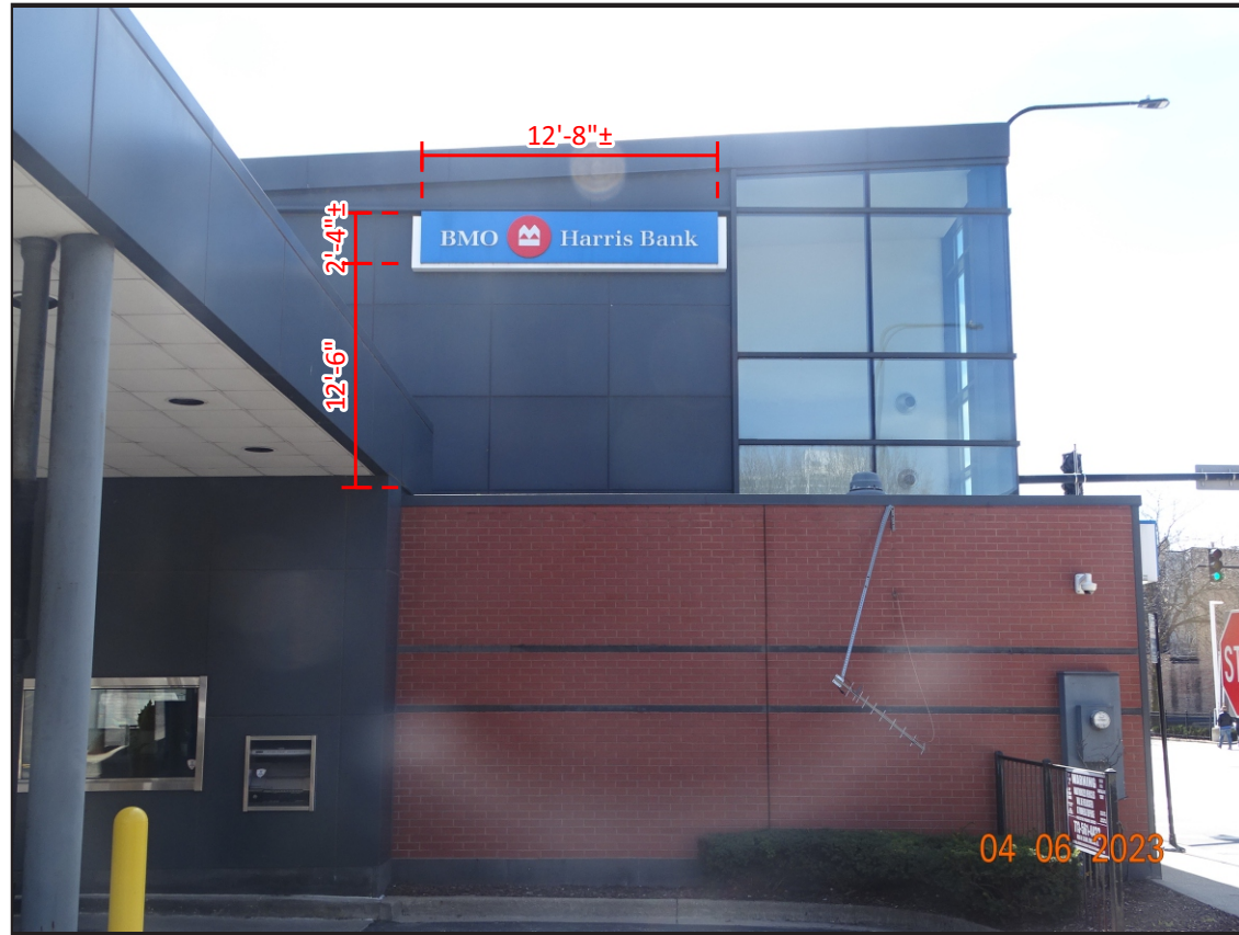
EXISTING ELEVATION REMOVE & DISCARD EXISTING ONE [1] SIGN CABINET